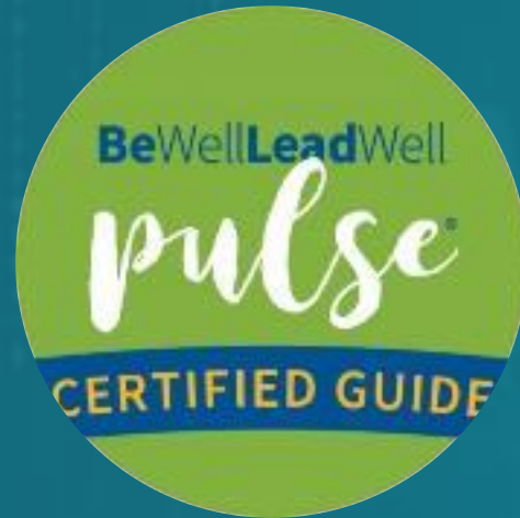
Thriving Leadership Assessment