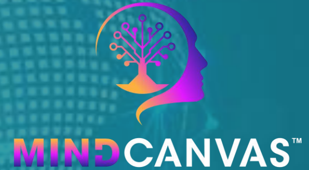
Visual Expression Assessment