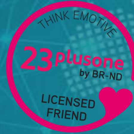
Card Base Positive Stimulus